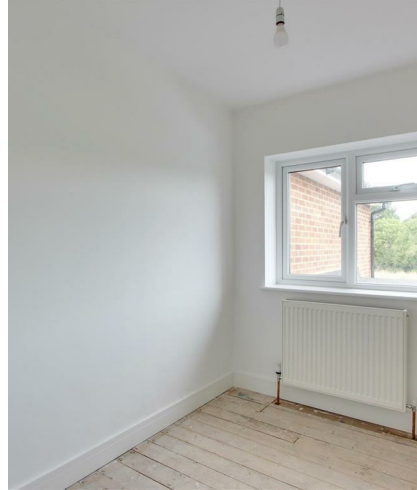
A spacious four bedroom home situated in the very heart of the village and NO ONWARD CHAIN.